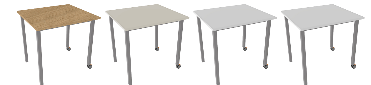
Sublime Teak Oyster Grey Polar White White Writeable