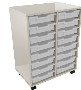
Double Bay (with 16 shallow Tote Trays)