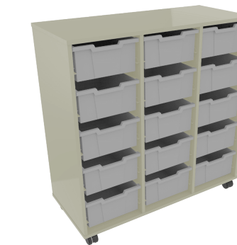
Triple Bay (with 15 deep Tote Trays)