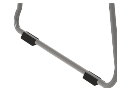
Black Rubber Glides