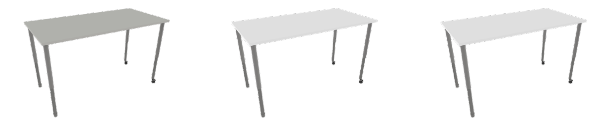
Oyster Grey Polar White White Writeable