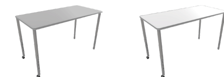
Fog Grey White Writeable